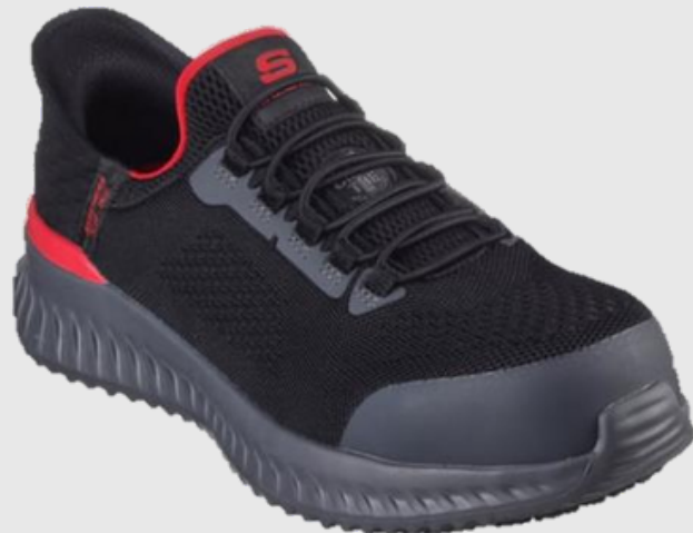
200206 BKRD (M)

Bring your A-game to work with convenience, comfort and safety wearing Skechers Hands Free Slip-ins® Work™: Tilido - Fletchit. This slip-on work design features an engineered mesh and synthetic upper with a stretch-lace front, a unique Skechers Slip-ins® molded heel panel, exclusive Heel Pillow™, composite safety toe, and a cushioned Air-Cooled Memory Foam® insole.