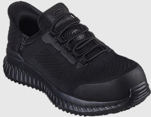
200206 BLK (M)