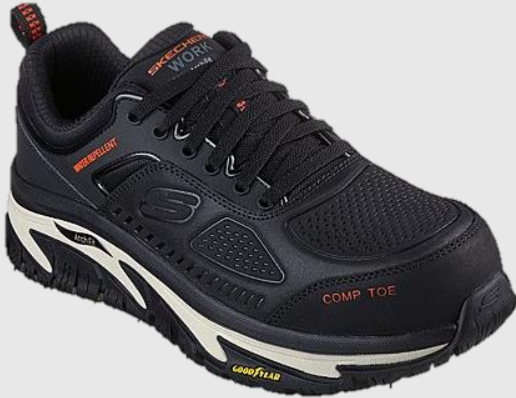
200154 BLK (M)

Gear up with all-day support and protection wearing Skechers Work™: Arch Fit® Road Walker - Raylan. This water-repellent lace-up features a leather, synthetic and mesh upper with a composite safety toe, removable Arch Fit® insole and Goodyear® Performance Outsole.